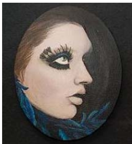
Girl by Erin Bousfield '10